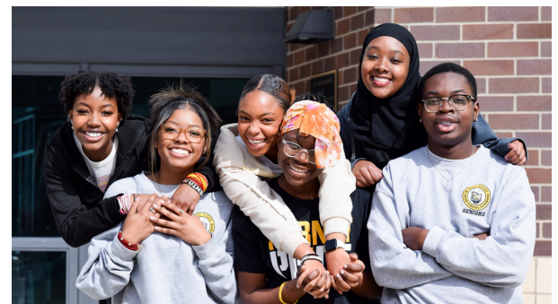
Black Student Alliance leaders

*Extracurriculars change year to year based on student interest!