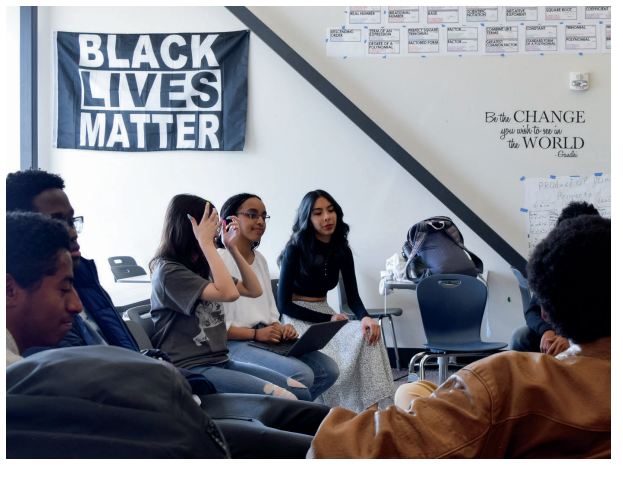
DSST: Montview Anti-defamation League Club