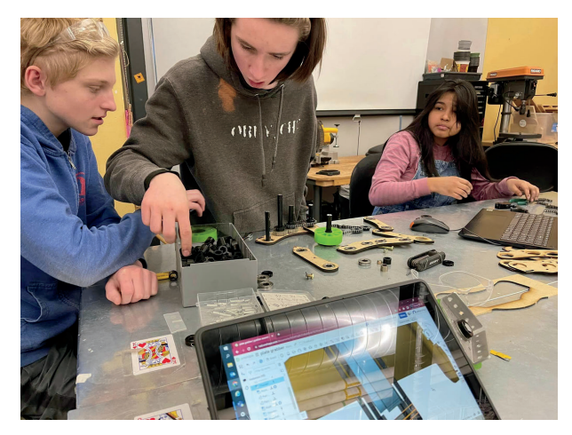
DSST: Montview Brute Force Robotics Club