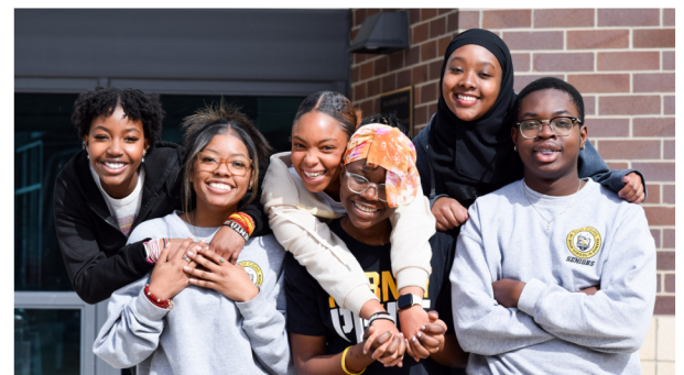
Black Student Alliance leaders